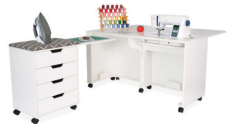
Laverne & Shirley Sewing Cabinet