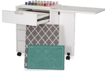
Shirley Storage Cabinet

There can never be too much storage space in your sewing room! Arrow's dedicated storage cabinets are designed for organization and accessibility. Arrow's Shirley features 4 dedicated storage drawers, a cutting mat, pressing mat, and two removable thread boards! Available in Teak and White finishes. Cute and functional!