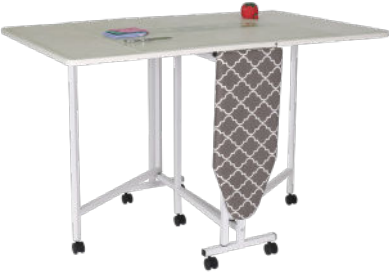
Millie Cutting and Pressing Table

Arrow sewing cabinet - check! Now add even more convenience to your studio with a dedicated cutting and pressing table like Millie , specially designed to complement your primary Arrow sewing cabinet. Add style, convenience and comfort to your growing sewing oasis!