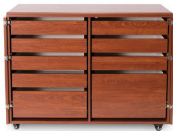
Dingo Cutting Table

Kangaroo sewing cabinet - check! Now complete your studio with Kangaroo storage and cutting furniture, specially designed to complement your primary workstation. With extra storage and workspace, you can customize your sewing room to be stylish, comfortable, and even more productive!