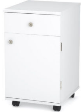
Suzi Storage Cabinet

There can never be too much storage space in your sewing room! Arrow's dedicated storage cabinets are designed for organization and accessibility. Arrow's Suzi , features 4 dedicated storage drawers and comes in Oak and White finishes! Cute and functional!