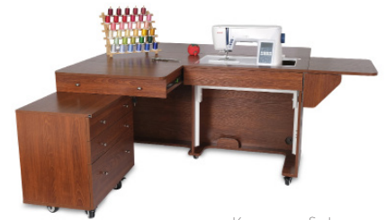
Kangaroo & Joey