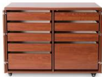
Dingo Cutting Table

Kangaroo sewing cabinet - check! Now complete your studio with Kangaroo storage and cutting furniture, specially designed to complement your primary workstation. With extra storage and workspace, you can customize your sewing room to be stylish, comfortable, and even more productive!