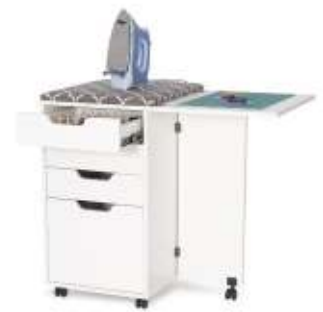
Kiwi Storage Cabinet

Every dream sewing oasis needs its cute, dependable accessories! Add even more convenience with a storage cabinet like Kiwi , featuring a built-in ironing board, cutting mat, thread drawers and a dedicated drawer to store your iron! Your dream sewing space won't be the same without it!