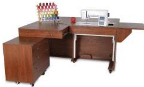
Kangaroo & Joey Sewing Cabinet

Kangaroo sewing cabinet - check! Now complete your studio with Kangaroo storage and cutting furniture, specially designed to complement your primary workstation. With extra storage and workspace, you can customize your sewing room to be stylish, comfortable, and even more productive!