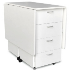
Kookaburra Cutting Table

Every dream sewing oasis needs functional, dependable accessories! Add even more convenience with a cutting table like Kookaburra , featuring two fold out leaves, four self-closing drawers, four rear removable shelves, and locking casters for easy mobility! Your dream sewing space won't be the same without it!