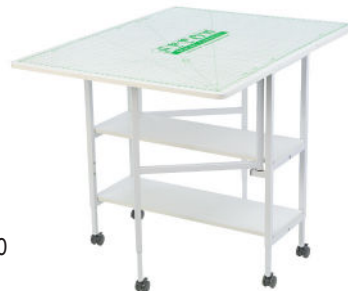
Dixie Cutting Table

Arrow sewing cabinet - check! Now add even more convenience to your studio with a dedicated cutting table like Dixie , specially designed to complement your primary Arrow sewing cabinet. Add style, storage and comfort to your growing sewing oasis!