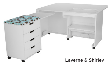
Laverne & Shirley Sewing Cabinet