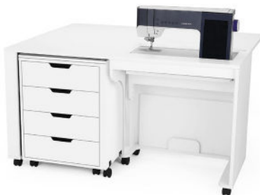
Laverne & Shirley Sewing Cabinet

Sewing cabinets provide comfort, easy set-up, dedicated storage for your machine and notions, different positions for better sewing posture and a spirited environment for crafting. Your machine deserves better than the dining room table! Sew in comfort, sew longer!