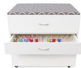
MOD Embroidery Arm Storage Cabinet

Every dream sewing oasis needs its cute, dependable accessories! Add even more convenience with MOD Embroidery Arm Storage Cabinet - featuring dedicated storage for your embroidery machine, a built-in ironing board and expansive thread drawers! Your dream sewing space won't be the same without it!