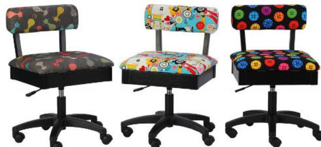
Cat's Meow, Sew Wow Sew Now & Bright Buttons Chairs

The cherry on top of your sewing sundae! Arrow's #1 Rated Height Adjustable Sewing Chair is a must have accessory for your dream sewing room! Cute, comfortable and convenient - our lovable chairs feature vibrant sewing themed patterns, 360° swivel access and lumbar support for long hours at your workstation. Don't look now, but under every seat cushion is a hidden storage compartment to store your notions and patterns! Available in 10 colors to perfectly match your sewing sanctuary!