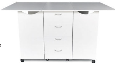
Kookaburra Cutting Table

Kangaroo sewing cabinet - check! Now complete your studio with Kangaroo storage and cutting furniture, specially designed to complement your primary workstation. With extra storage and workspace, you can customize your sewing room to be stylish, comfortable, and even more productive!