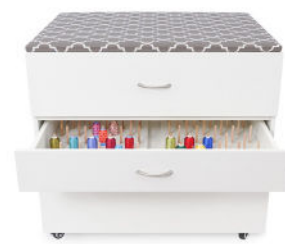
MOD Embroidery Arm Storage Cabinet

Every dream sewing oasis needs its cute, dependable accessories! Add even more convenience with MOD Embroidery Arm Storage Cabinet - featuring dedicated storage for your embroidery machine, a built-in ironing board and expansive thread drawers! Your dream sewing space won't be the same without it!