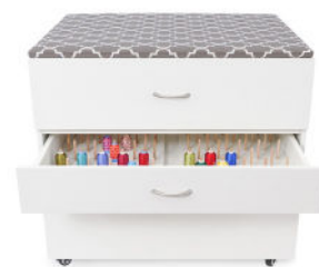
MOD Embroidery Arm Storage Cabinet

Every dream sewing oasis needs its cute, dependable accessories! Add even more convenience with MOD Embroidery Arm Storage Cabinet - featuring dedicated storage for your embroidery machine, a built-in ironing board and expansive thread drawers! Your dream sewing space won't be the same without it!