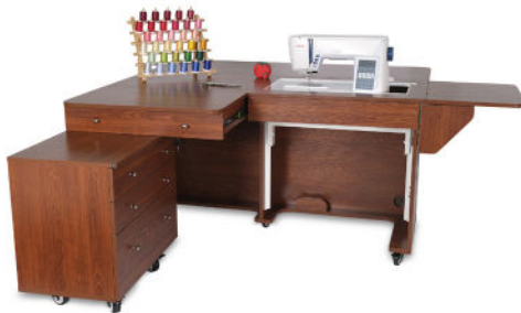
Kangaroo & Joey Sewing Cabinet

Sewing cabinets provide comfort, easy set-up and dedicated storage for your machine and notions. They produce an enjoyable, ergonomic sewing experience and create a spirited environment for sewing and crafting! Your machine deserves better than the dining room table, and so do you! Sew in comfort and sew longer with Kangaroo's sewing cabinets!