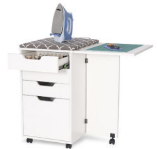
Kiwi Storage Cabinet

Every dream sewing oasis needs its cute, dependable accessories! Add even more convenience with a storage cabinet like Kiwi , featuring a built-in ironing board, cutting mat, thread drawers and a dedicated drawer to store your iron! Your dream sewing space won't be the same without it!