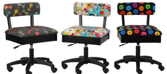
Cat's Meow, Sew Wow Sew Now & Bright Buttons Chairs

The cherry on top of your sewing sundae! Arrow's #1 Rated Height Adjustable Sewing Chair is a must have accessory for your dream sewing room! Cute, comfortable and convenient - our lovable chairs feature vibrant sewing themed patterns, 360° swivel access and lumbar support for long hours at your workstation. Don't look now, but under every seat cushion is a hidden storage compartment to store your notions and patterns! Available in 10 colors to perfectly match your sewing sanctuary!