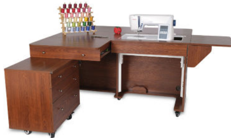
Kangaroo & Joey Sewing Cabinet

Sewing cabinets provide comfort, easy set-up and dedicated storage for your machine and notions. They produce an enjoyable, ergonomic sewing experience and create a spirited environment for sewing and crafting! Your machine deserves better than the dining room table, and so do you! Sew in comfort and sew longer with Kangaroo's sewing cabinets!