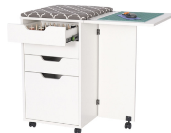
Kiwi Storage Cabinet

Every dream sewing oasis needs its cute, dependable accessories! Add even more convenience with a storage cabinet like Kiwi, featuring a built-in ironing board, cutting mat, thread drawers and a dedicated drawer to store your iron! Your dream sewing space won't be the same without it!