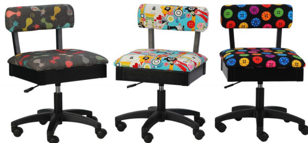
Cat's Meow, Sew Wow Sew Now & Bright Buttons Chairs

The cherry on top of your sewing sundae! Arrow's #1 Rated Height Adjustable Sewing Chair is a must have accessory for your dream sewing room! Cute, comfortable and convenient - our lovable chairs feature vibrant sewing themed patterns, 360° swivel access and lumbar support for long hours at your workstation. Don't look now, but under every seat cushion is a hidden storage compartment to store your notions and patterns! Available in 10 colors to perfectly match your sewing sanctuary!