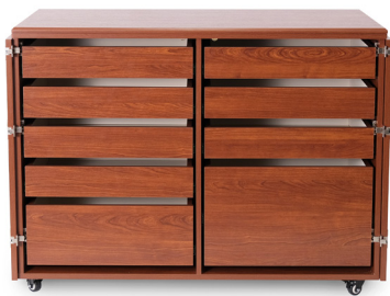
Dingo Cutting Table

Kangaroo sewing cabinet - check! Now complete your studio with Kangaroo storage and cutting furniture, specially designed to complement your primary workstation. With extra storage and workspace, you can customize your sewing room to be stylish, comfortable, and even more productive!