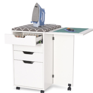
Kiwi Storage Cabinet

Every dream sewing oasis needs its cute, dependable accessories! Add even more convenience with a storage cabinet like Kiwi , featuring a built-in ironing board, cutting mat, thread drawers and a dedicated drawer to store your iron! Your dream sewing space won't be the same without it!