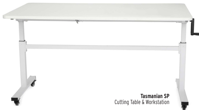
Tasmanian SP Cutting Table & Workstation