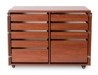
Dingo Cutting Table

Kangaroo sewing cabinet - check! Now complete your studio with Kangaroo storage and cutting furniture, specially designed to complement your primary workstation. With extra storage and workspace, you can customize your sewing room to be stylish, comfortable, and even more productive!