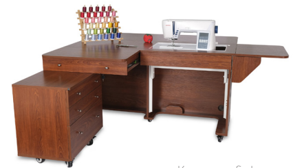
Kangaroo & Joey