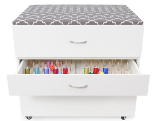
MOD Embroidery Storage Cabinet

Every dream sewing oasis needs its cute, dependable accessories! Add even more convenience with MOD Embroidery Storage Cabinet - featuring dedicated storage for your embroidery machine, a built-in ironing board and expansive thread drawers! Your dream sewing space won't be the same without it!