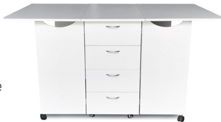
Kookaburra Cutting Table

Americana sewing cabinet - check! Now complete your studio with Kangaroo storage and cutting furniture, specially designed to complement your primary workstation. With extra storage and workspace, you can customize your sewing room to be stylish, comfortable, and even more productive!