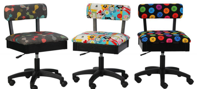
Cat's Meow, Sew Wow Sew Now & Bright Buttons Chairs

The cherry on top of your sewing sundae! Arrow's #1 Rated Height Adjustable Sewing Chair is a must have accessory for your dream sewing room! Cute, comfortable and convenient - our lovable chairs feature vibrant sewing themed patterns, 360° swivel access and lumbar support for long hours at your workstation. Don't look now, but under every seat cushion is a hidden storage compartment to store your notions and patterns! Available in 10 colors to perfectly match your sewing sanctuary!