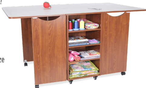
Kookaburra Cutting Table

Kangaroo sewing cabinet - check! Now complete your studio with Kangaroo storage and cutting furniture, specially designed to complement your primary workstation. With extra storage and workspace, you can customize your sewing room to be stylish, comfortable, and even more productive!