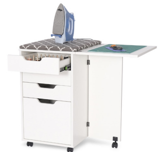
Kiwi Storage Cabinet

Every dream sewing oasis needs its cute, dependable accessories! Add even more convenience with a storage cabinet like Kiwi, featuring a built-in ironing board, cutting mat, thread drawers and a dedicated drawer to store your iron! Your dream sewing space won't be the same without it!