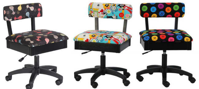
Cat's Meow, Sew Wow Sew Now & Bright Buttons Chairs

The cherry on top of your sewing sundae! Arrow's #1 Rated Height Adjustable Sewing Chair is a must have accessory for your dream sewing room! Cute, comfortable and convenient - our lovable chairs feature vibrant sewing themed patterns, 360° swivel access and lumbar support for long hours at your workstation. Don't look now, but under every seat cushion is a hidden storage compartment to store your notions and patterns! Available in multiple colors and prints to perfectly match your sewing sanctuary!