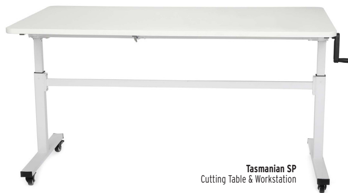
Tasmanian SP Cutting Table & Workstation