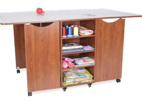
Kookaburra Cutting Table

Kangaroo sewing cabinet - check! Now complete your studio with Kangaroo storage and cutting furniture, specially designed to complement your primary workstation. With extra storage and workspace, you can customize your sewing room to be stylish, comfortable, and even more productive!