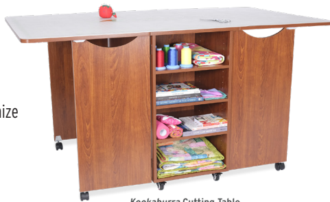
Kookaburra Cutting Table

Kangaroo sewing cabinet - check! Now complete your studio with Kangaroo storage and cutting furniture, specially designed to complement your primary workstation. With extra storage and workspace, you can customize your sewing room to be stylish, comfortable, and even more productive!