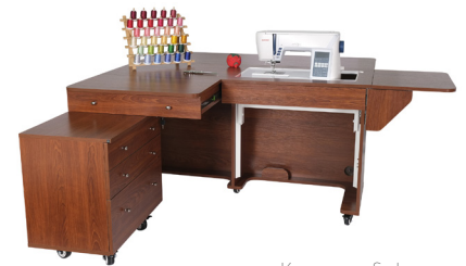
Kangaroo & Joey