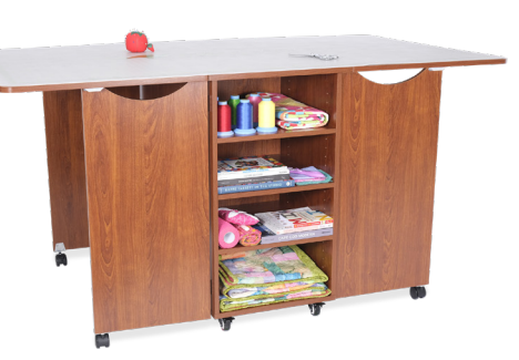
Kookaburra Cutting Table

Kangaroo sewing cabinet - check! Now complete your studio with Kangaroo storage and cutting furniture, specially designed to complement your primary workstation. With extra storage and workspace, you can customize your sewing room to be stylish, comfortable, and even more productive!