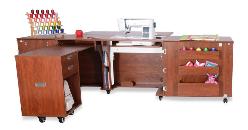
Aussie Sewing Cabinet