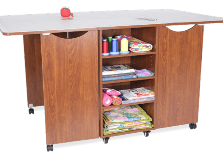
Kookaburra Cutting Table

Kangaroo sewing cabinet - check! Now complete your studio with Kangaroo storage and cutting furniture, specially designed to complement your primary workstation. With extra storage and workspace, you can customize your sewing room to be stylish, comfortable, and even more productive!