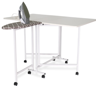
Millie Cutting and ironing Table

Arrow sewing cabinet - check! Now add even more convenience to your studio with a dedicated cutting and ironing table like Millie , specially designed to complement your primary Arrow sewing cabinet. Add style, storage and comfort to your growing sewing oasis!