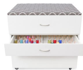
MOD Embroidery Arm Storage Cabinet

Every dream sewing oasis needs its cute, dependable accessories! Add even more convenience with MOD Embroidery Arm Storage Cabinet - featuring dedicated storage for your embroidery machine, a built-in ironing board and expansive thread drawers! Your dream sewing space won't be the same without it!