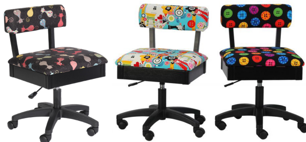
Cat's Meow, Sew Wow Sew Now & Bright Buttons Chairs

The cherry on top of your sewing sundae! Arrow's #1 Rated Height Adjustable Sewing Chair is a must have accessory for your dream sewing room! Cute, comfortable and convenient - our lovable chairs feature vibrant sewing themed patterns, 360° swivel access and lumbar support for long hours at your workstation. Don't look now, but under every seat cushion is a hidden storage compartment to store your notions and patterns! Available in multiple colors and prints to perfectly match your sewing sanctuary!