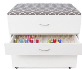
MOD Embroidery Arm Storage Cabinet

Every dream sewing oasis needs its cute, dependable accessories! Add even more convenience with MOD Embroidery Arm Storage Cabinet - featuring dedicated storage for your embroidery machine, a built-in ironing board and expansive thread drawers! Your dream sewing space won't be the same without it!