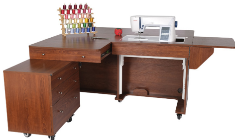
Kangaroo & Joey Sewing Cabinet

Sewing cabinets provide comfort, easy set-up and dedicated storage for your machine and notions. They produce an enjoyable, ergonomic sewing experience and create a spirited environment for sewing and crafting! Your machine deserves better than the dining room table, and so do you! Sew in comfort and sew longer with Kangaroo's sewing cabinets!