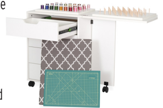
Shirley Storage Cabinet

There can never be too much storage space in your sewing room! Arrow's dedicated storage cabinets are designed for organization and accessibility. Arrow's Shirley features 4 dedicated storage drawers, spool holders, pressing mat and cutting mat, and comes in White and Teak finishes! Cute and functional!